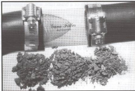
These particles were trapped by the Gano Filter and removed from the cooling system of a 1966 Mustang over a period of one year.

The Aluminum Model comes in Medium size only. It is a Satin finish that can be polished to Chrome like finish. The Aluminum Filter is only one third the weight of the brass housing.